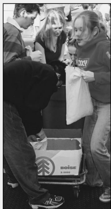
Students from Head Royce School in Oakland helped lift nearly one million pennies into the Pennies Truck. Together, their school raised over $9,200 for AEF clients! See related story on page 3.