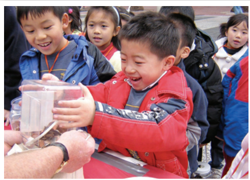
Youngsters from John Yehall Chin Elementary School bring their pennies to AEF!

Our school collection jars are a great way to raise awareness as well as funds, but it doesn't stop there – does your office have an EPC collection jar? Does your company have a donation match program? Industrial Light & Magic has raised nearly $50,000 in the last two years with ILM's annual company-wide spelling bee! How creative can you and your workplace be?