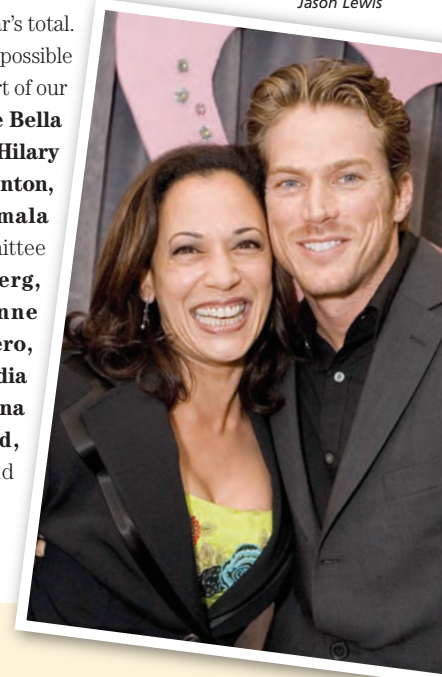
DA Kamala Harris with Sex And The City's Jason Lewis