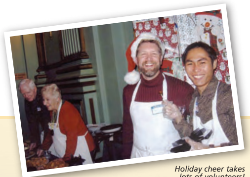
Holiday cheer takes lots of volunteers!